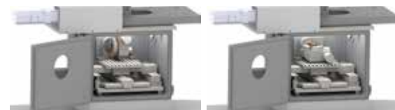
x/y manipulator with T-Nut plate and with internal rotary clamp mounted to the chamber.