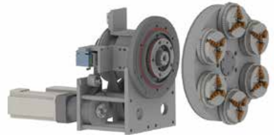
a.) Simple and fast change-over from a single-drum to a six-drum rotary motion manipulator with 3-jaw chuck.

The modular tilt and turning device allows an angled position of the turning device for radial or axial welds. The tilting of the turning device allows for easy access to fillet welds or other special welding geometries. This device includes several unique features, making it a more versatile tool for micro manipulation and welding. The devices grant a tight specification. Together with the minimized backlash and in combination with a precise x- y- table, free 3D interpolated workpiece positioning for welding or surface treatment becomes possible. Furthermore the turning device has a wide inner passage. This allows an easy manipulation and welding of long shafted rotational parts. Finally the devices are modular and easy to disassemble to be used separately.