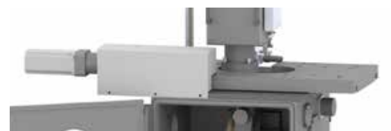
d) linear egun slide with 160mm travel in x-direction.