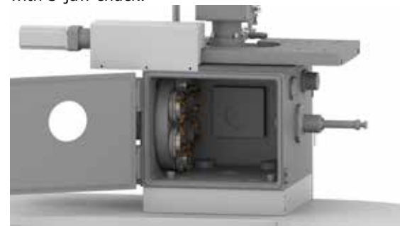
b.) Six-drum rotary motion manipulator with opposite tailstock mounted to the chamber sides.